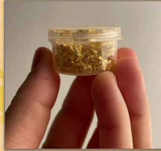
Scraps of gold leaf