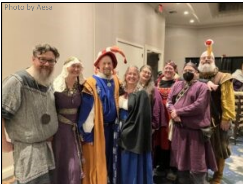
What do you call a flock of Pelicans? Malagentian.