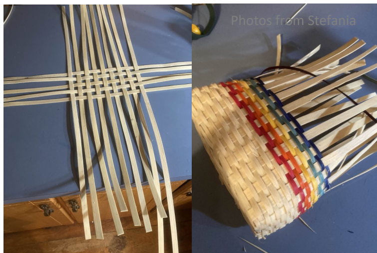
Pride woven in